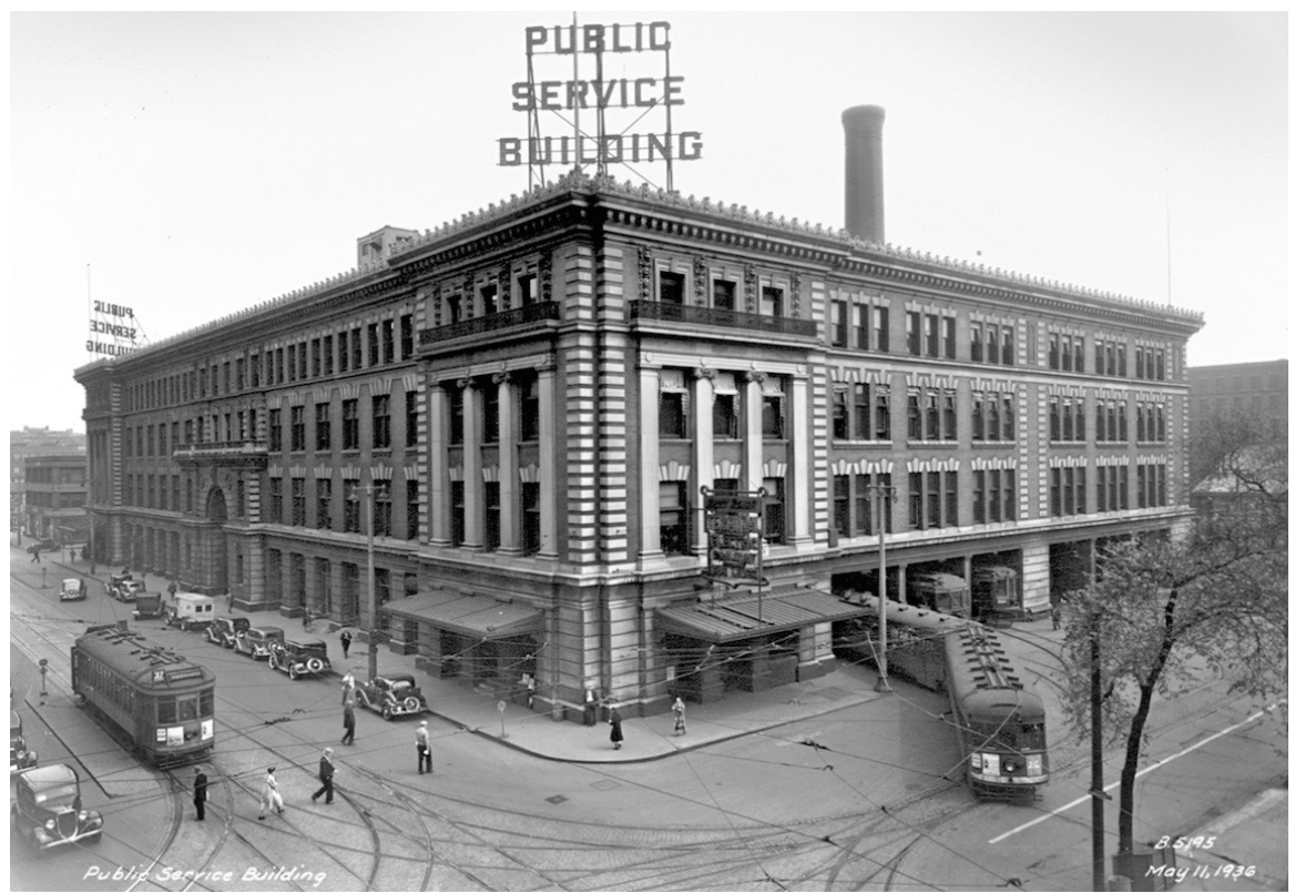
The Public Service Building in Milwaukee in 1936

Better roads and the fact that most families owned their own cars had begun to impact the trolley and interurban railroads across the country by the late 1920s. The great depression of the 1930's added significantly to the erosion of ridership and revenue. In October of 1938, TMER&L Co. was broken up into two separate companies. The Wisconsin Electric Power Company operated the power plants and handled electrical distribution; the Milwaukee Electric Railway and Transport Company (TMER&T) operated its transportation properties.