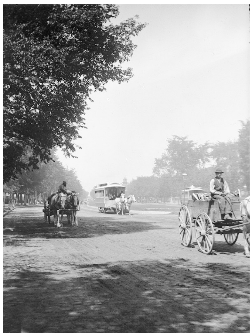
Horse-drawn trolley on Grand Avenue (Wisconsin Avenue) in 1885

The first street railway in the city of Milwaukee was The River and Lakeshore Railway Company, which started operations with two horse-drawn trolley cars in 1860. The River and Lakeshore Company was absorbed by the Milwaukee City Railway Company in 1865.